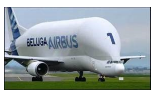
Jean-Philippe Cotett Airbus Beluga XL Development Flight Tests Campaign