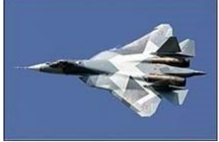
Dr. Panos Vitsas SM ITPS Flight Testing Stealth - Guidelines for Radar Cross Section (RCS) testing