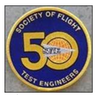
50<sup>th</sup> Anniversary Patch for all Members

Don't worry, if you would like to renew early to receive your items early your membership will be extended from its annual due date.