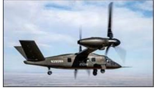
Don Grove<sup>M</sup> (M) Bell V-280 Valor: Highly Successful Results from a High-Performance Team