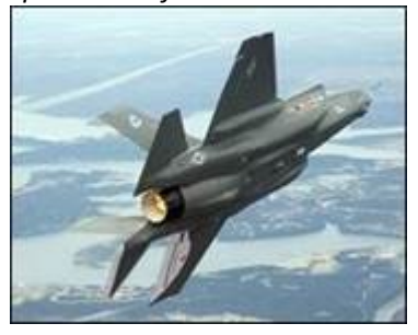
Dan Canin (AF) Lockheed Martin F-35 High Angle of Attack Flight Control Development and Flight Test Results